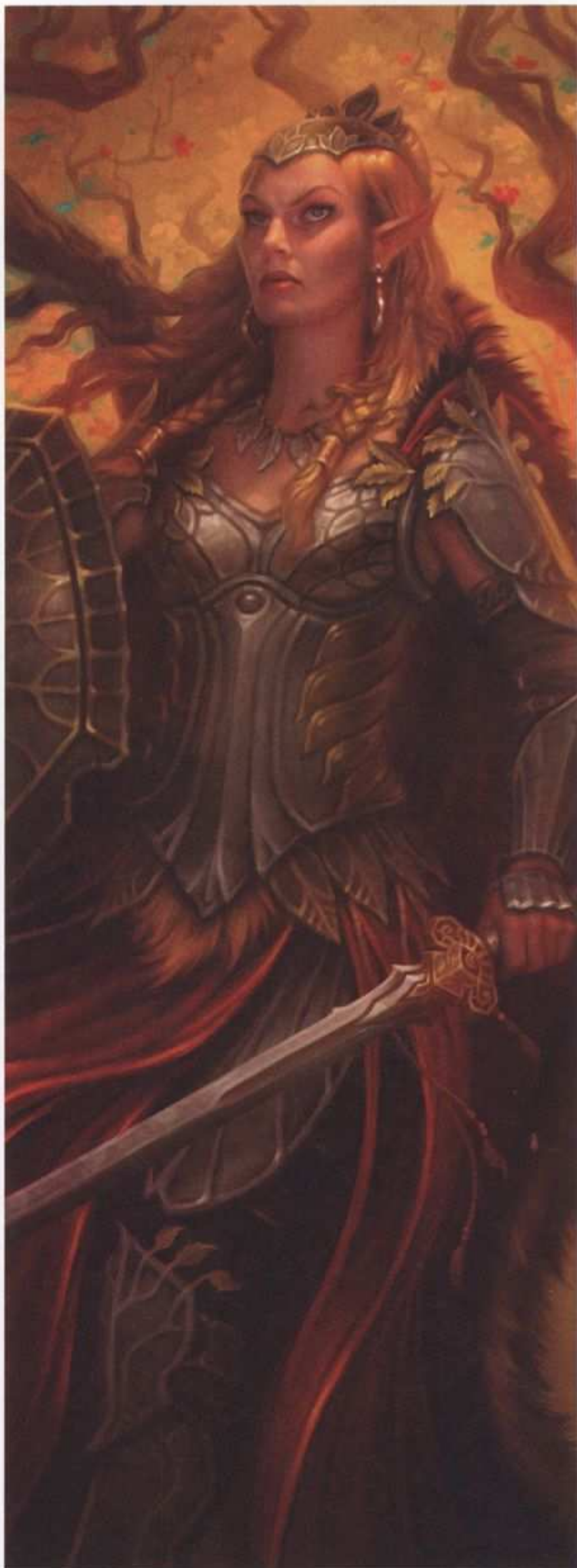
Lyriel, elf knight

You should remember that you are the party's defensive specialist when selecting stances at 1st level.