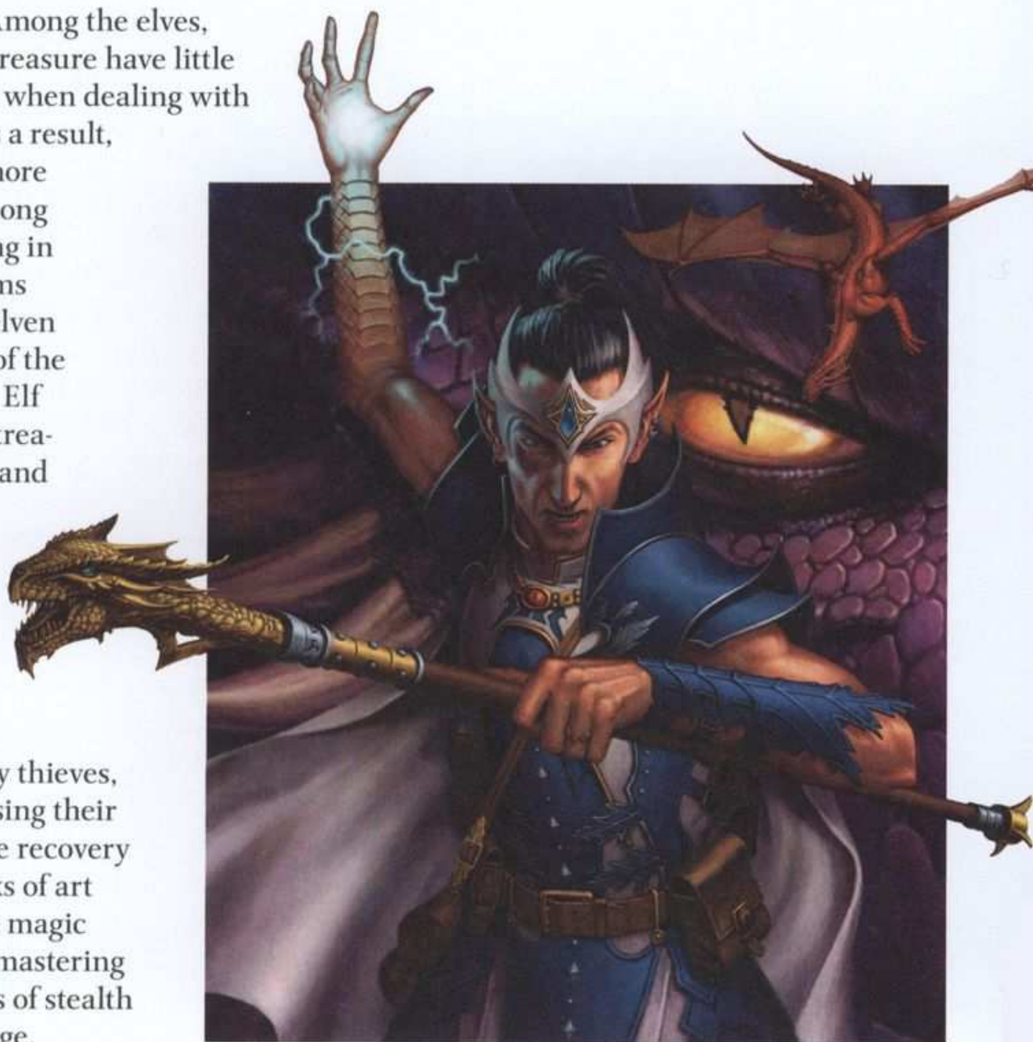
Elf wizards are adept at manipulating arcane energy

Wizard Elves are second only to their eladrin cousins as practitioners of the arcane arts. Most elf settlements augment their natural camouflage with illusions and other magic. When faced with invading enemies, an elf community calls on its wizards to unleash devastating arcane power. Elf wizards become adventurers to seek arcane lore, to test their skill and power, and to fight against the darkness that rises beyond the light of civilization. In their dedication to protect the natural world, elf wizards bear more resemblance to crusading warriors than to bookish sages.