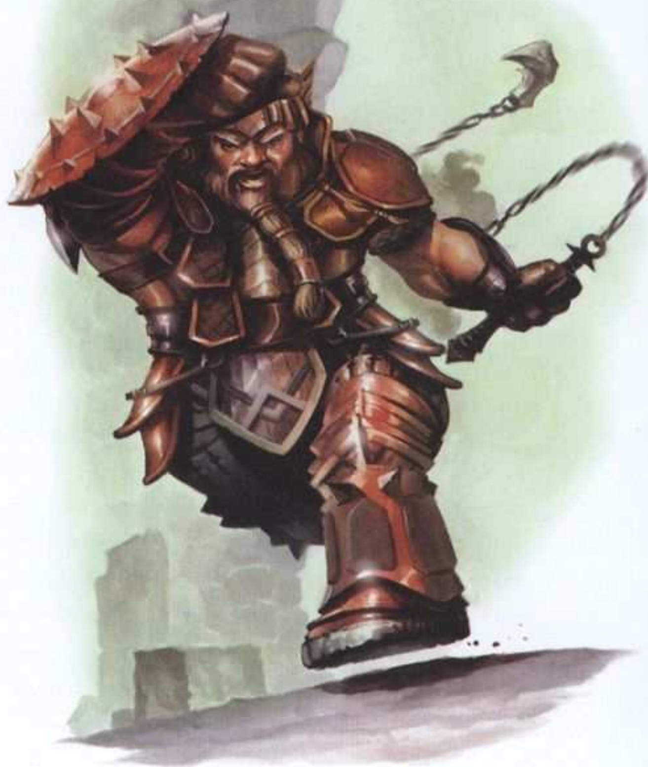
A dwarf knight charges into battle

Wizard Dwarves have long had a mistrust of the arcane arts, instead putting their faith in strength and steel. A dwarf wizard is almost always something of a recluse among his or her people. However, the inclination to study spellcraft is built on the same ingenuity and focus that makes the dwarves legendary crafters in so many other disciplines. To dwarf wizards, casting a spell is much like