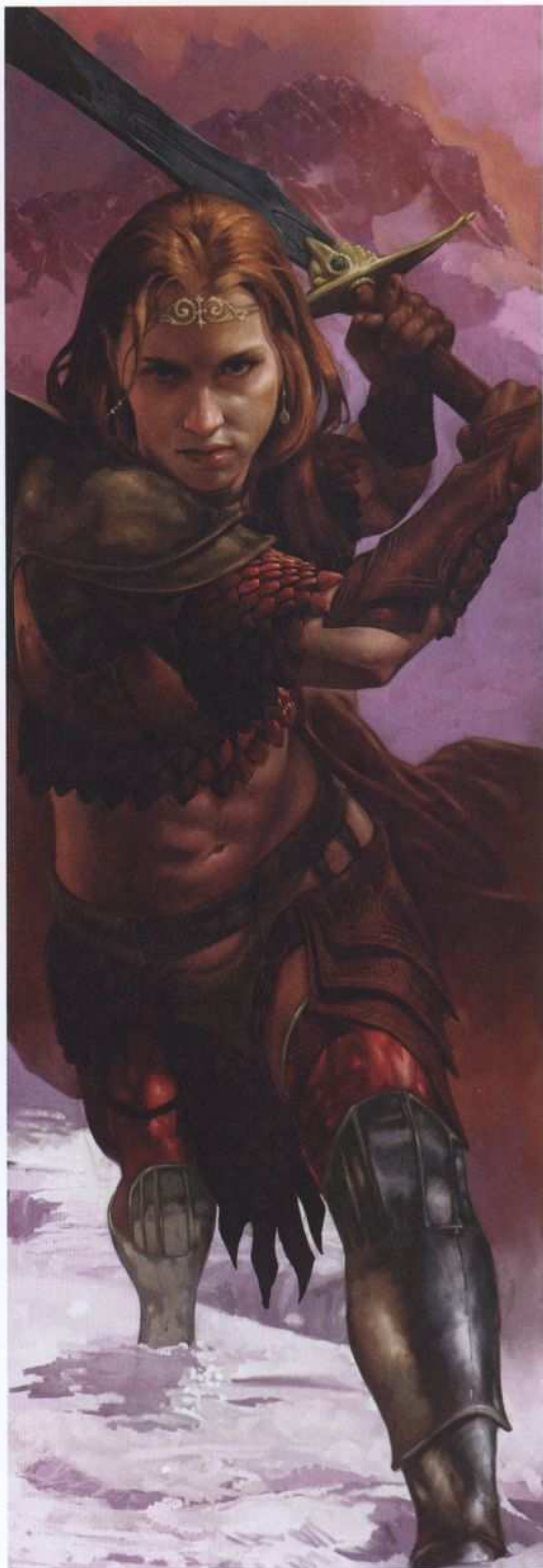
Shara, human slayer

A slayer focuses on offense, but the stances you choose at 1st level can increase your flexibility. Unfettered fury's attack penalty counters