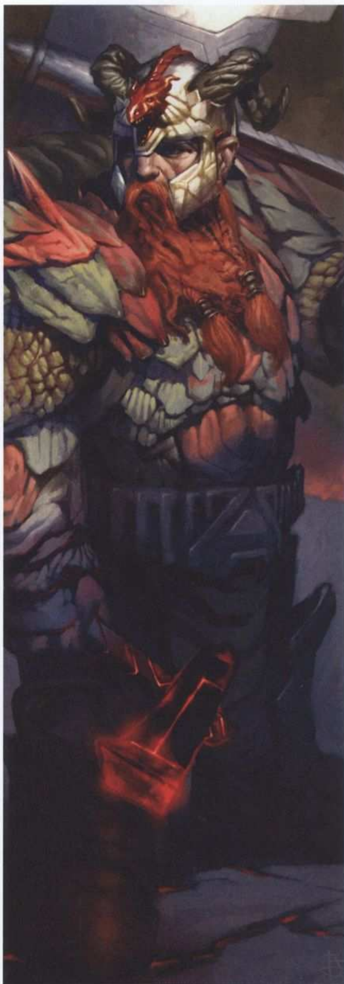
Fargrim, dwarf slayer

Human When creating a human slayer, put your ability score bonus into Strength to maximize your effectiveness in combat. You can then rely on your racial bonus to defenses to aid your Fortitude, Reflex, and Will and keep your slayer alive to finish every fight.