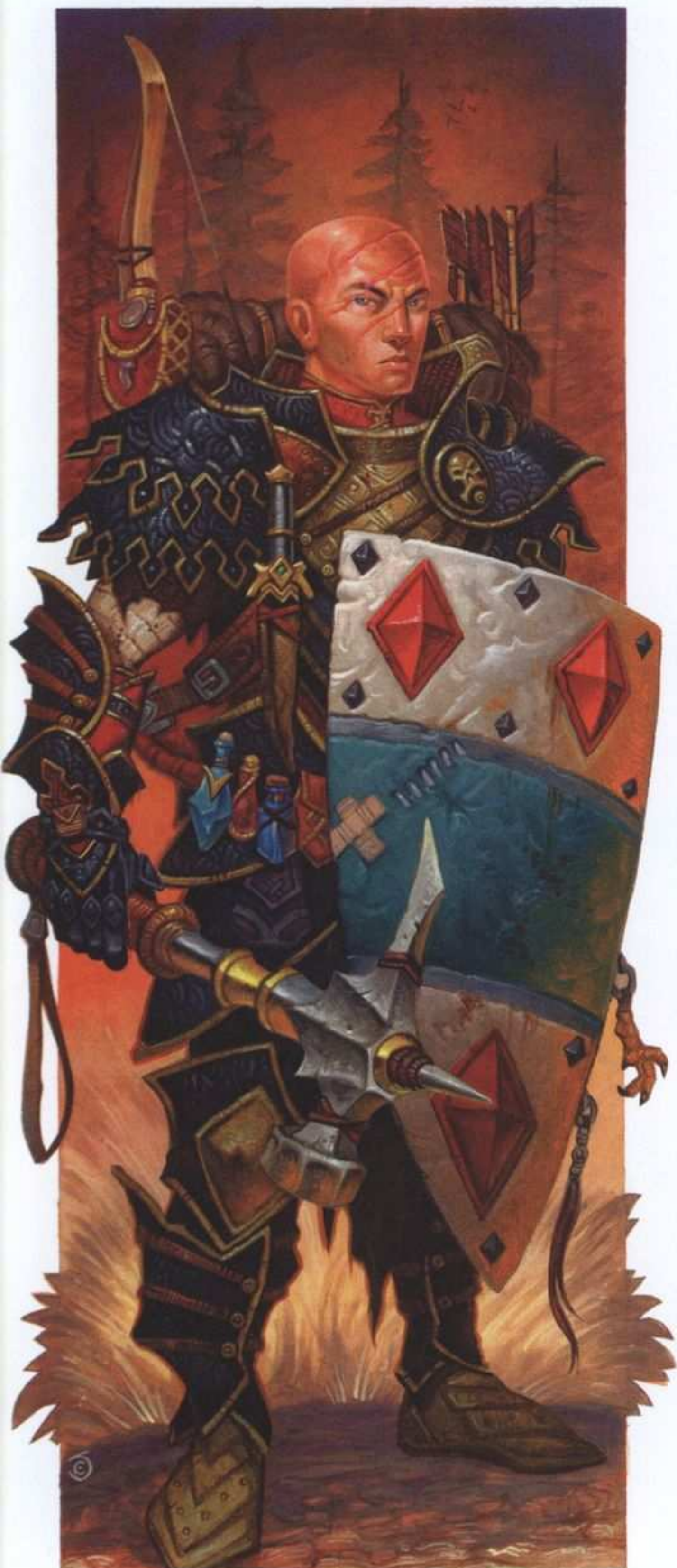
Dendric, human knight

Defend the line is a good choice, because it slows down your enemies and gives your allies room to maneuver. Cleaving assault is another good choice if the party lacks other close quarters fighters, since it allows you to damage multiple foes with one attack. Otherwise, poised assault 's bonus to accuracy makes each of your attacks more likely to count.