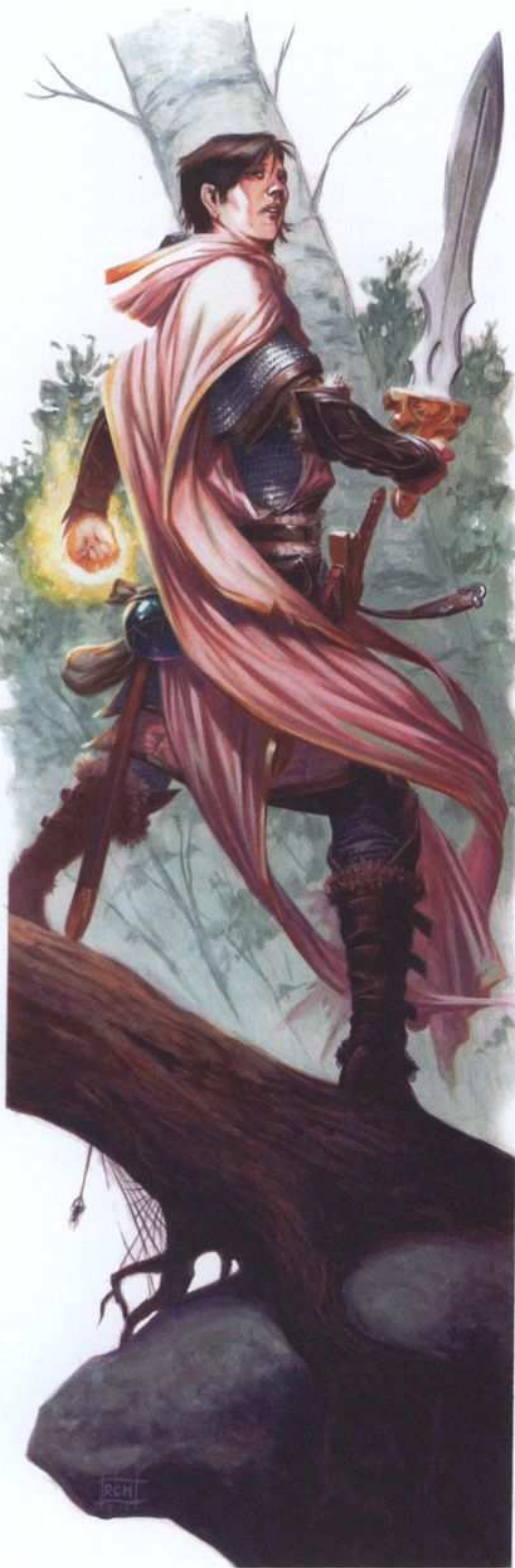
Falon, human warpriest