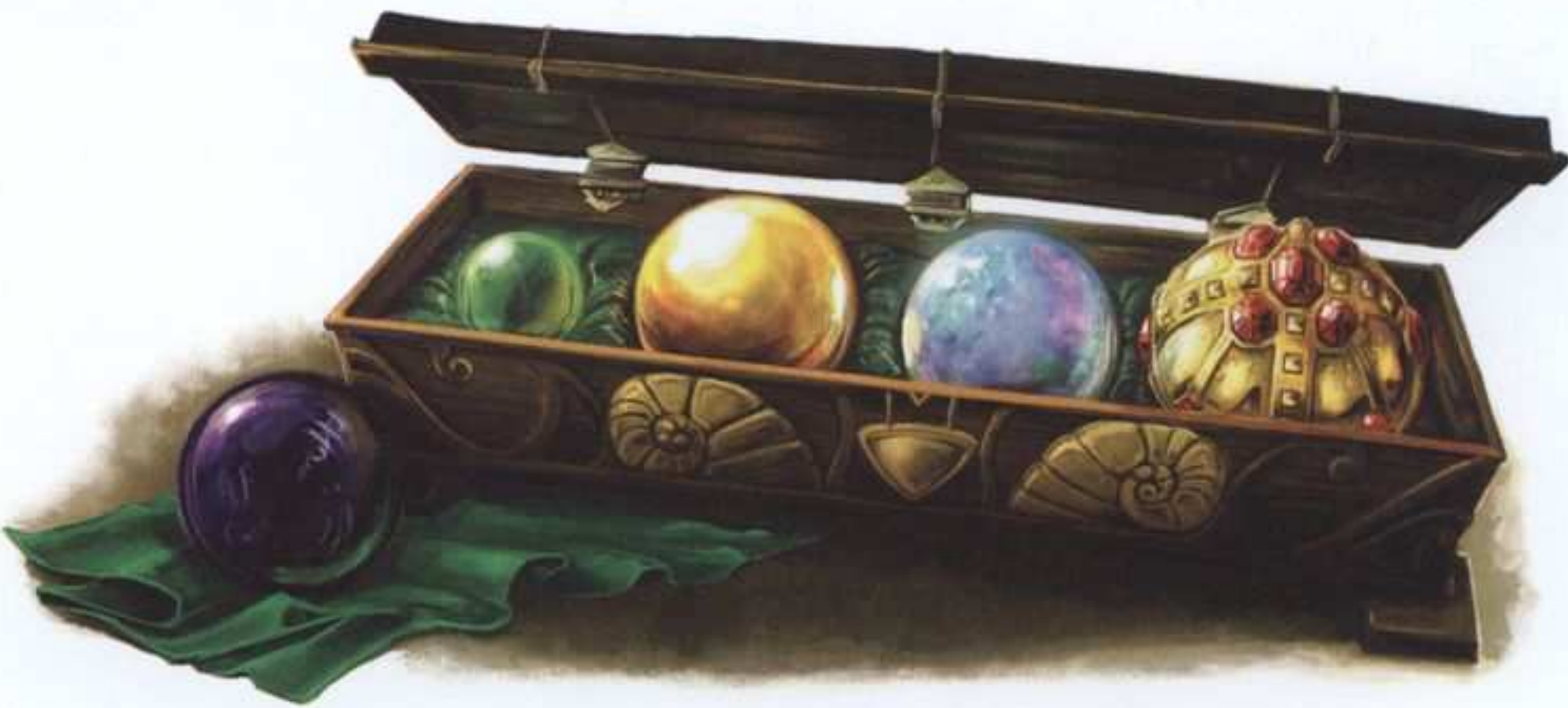
Orbs come in a wide range of colors and styles