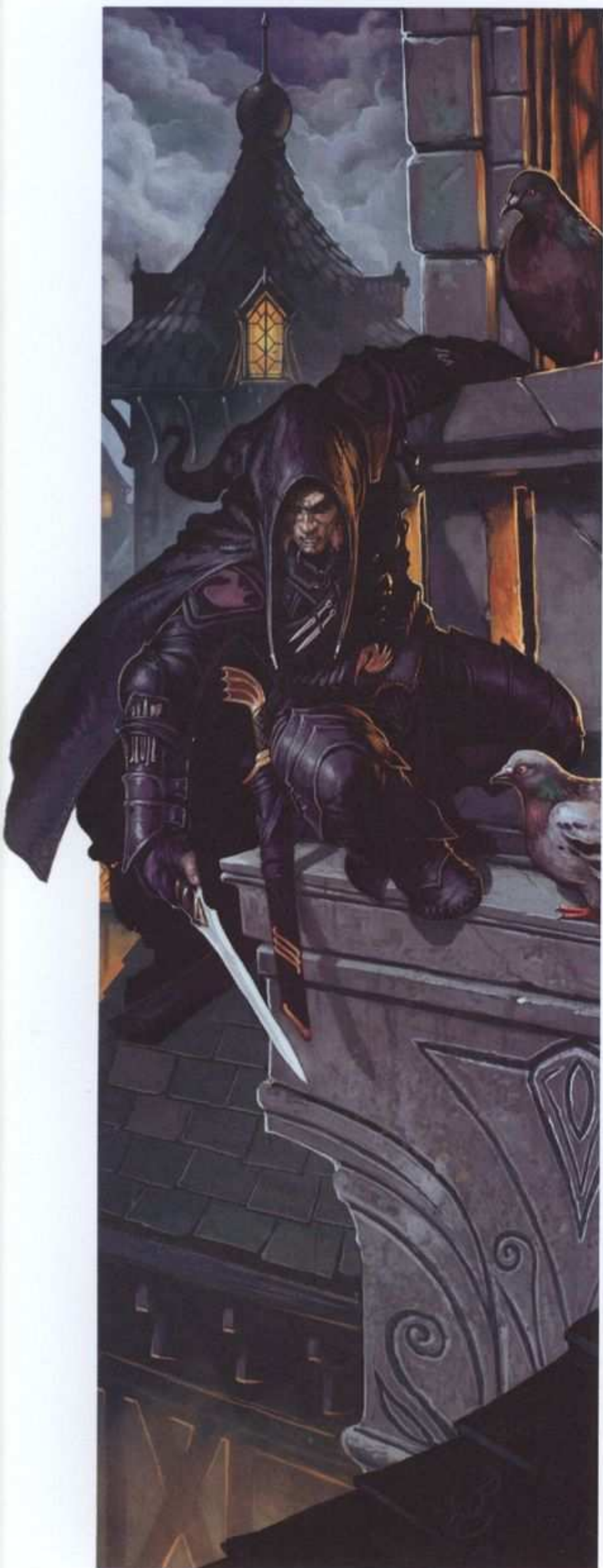
Uldane, halfelf thief