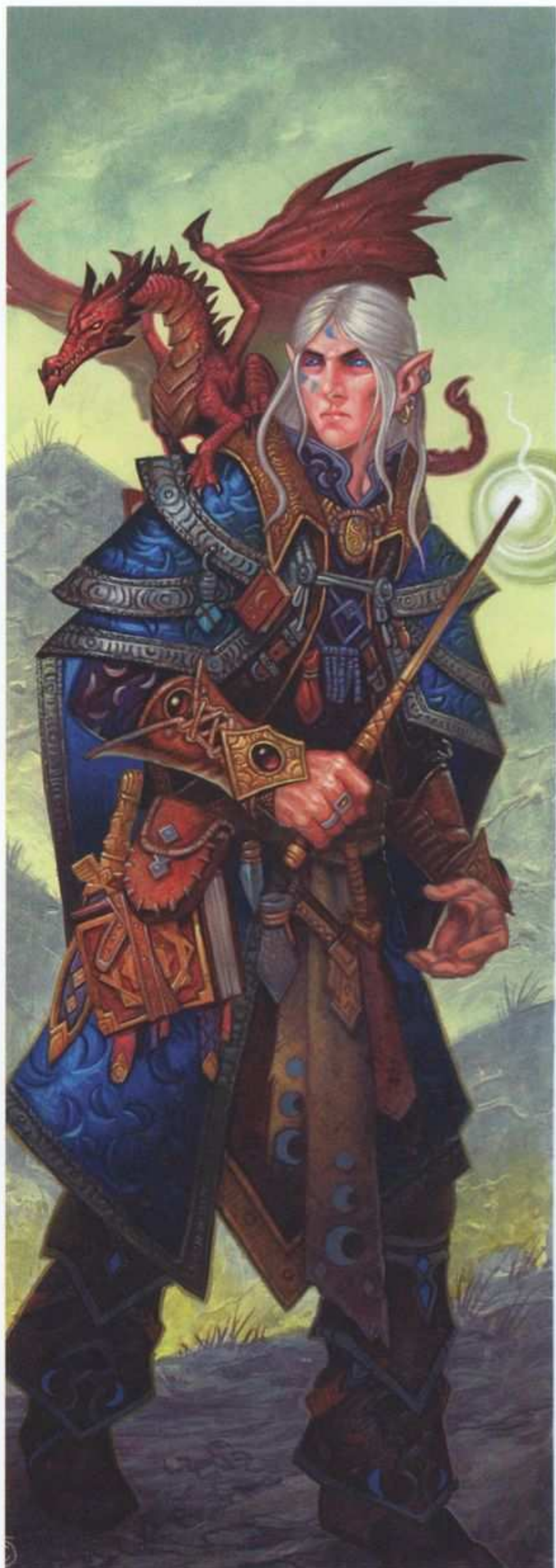
Albanon, eladrin mage, with Splendid the pseudodragon

Human mages tend to worship Corellon or Ioun according to their individual history. Self-taught or apprenticed mages feel an innate connection to the raw power of arcane magic as Corellon first