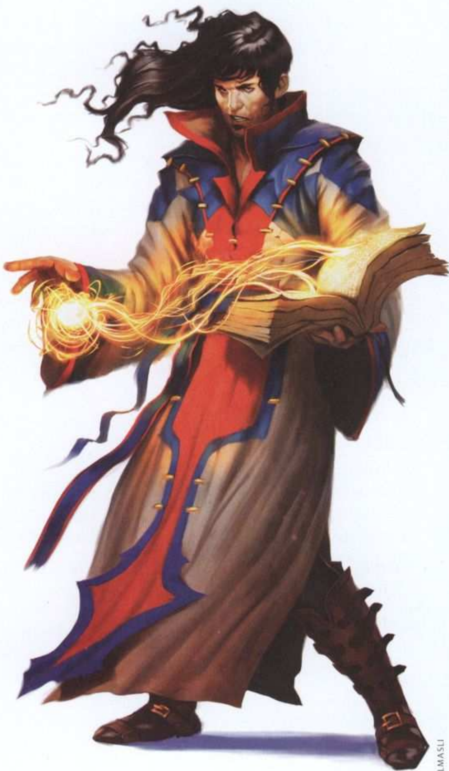
A human mage casts from his spellbook

Wizard Although humans were not the first folk to master arcane magic, they are now among its most skilled practitioners. A human character's natural curiosity and ambition are well suited to dedicating endless hours to the study of spells and arcane theories. Human wizards view the invention and