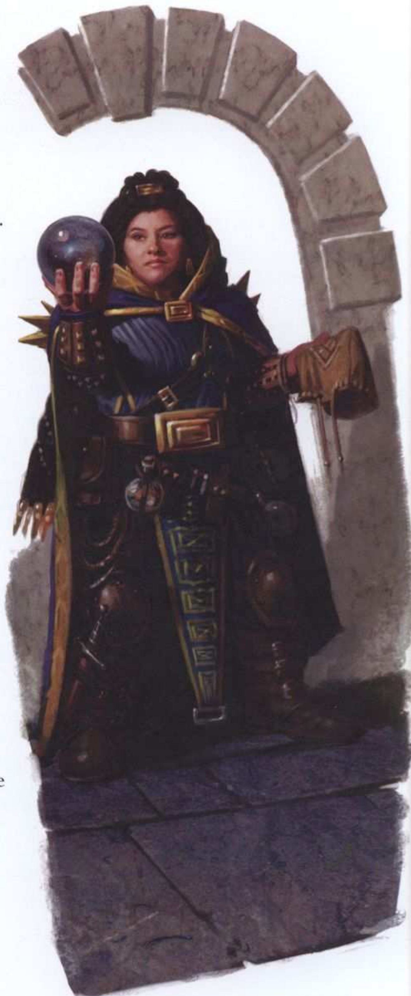
Kathra, dwarf mage

Since you use an implement, consider feats from the implement training category. Implement Focus or one of the expertise feats can make your attack spells even more potent. Likewise, feats from the quick reaction category allow you to unleash your spells before your enemies can react, giving you an edge at the start of combat.