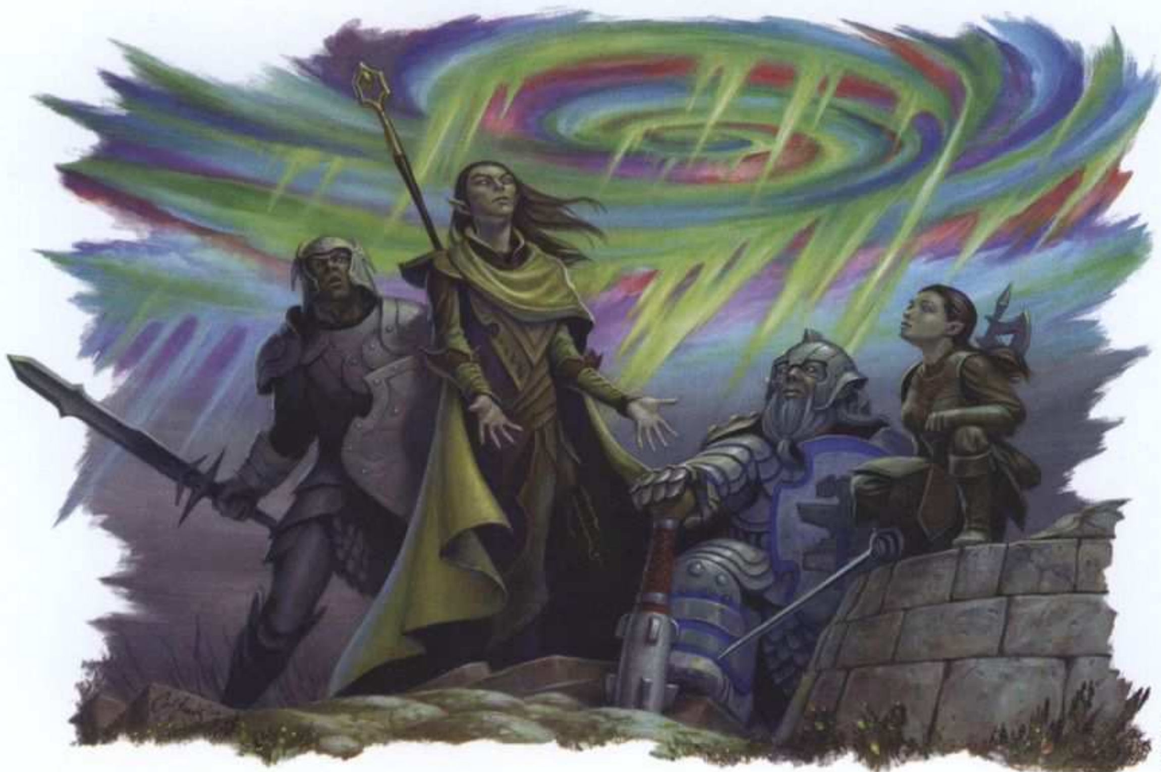
A mage calls forth an arcane power while his companions look on

Daily powers represent the most powerful effects that a character can produce, and using such a power takes a significant toll on a character's physical and mental resources. When a character uses a nonmagical daily power, the character is reaching into deep reserves of energy to pull off an amazing deed. When a character uses a magical daily power, the character might be reciting a magical formula of such complexity that his or her mind can hold it for only so long; once the formula is recited, it is wiped from memory and can be regained only as part of an extended rest. Or the magic of the power might be so strong that the character's mind and body can harness it only once per day.