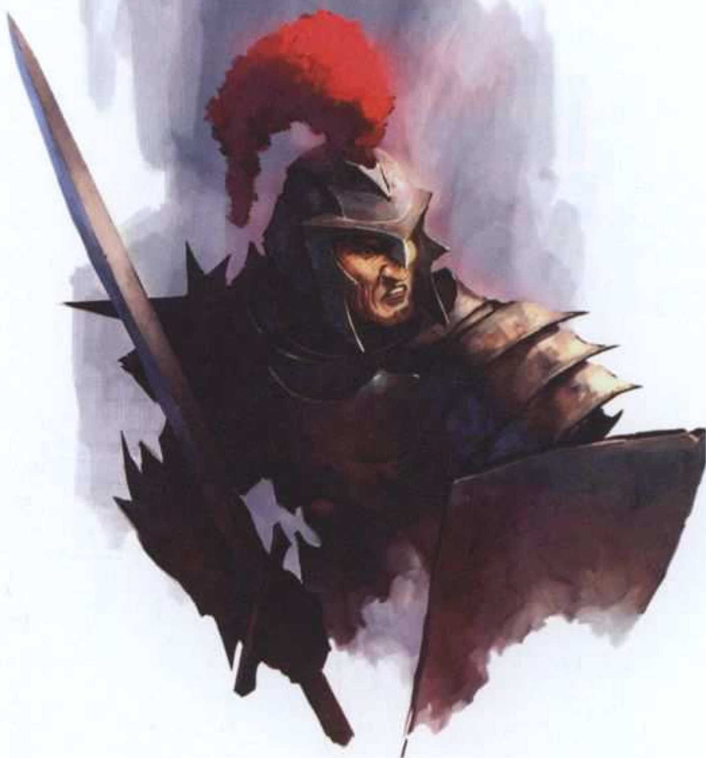
An epic knight is a hardened veteran

Benefit: You gain a power associated with your epic destiny (see page 245).