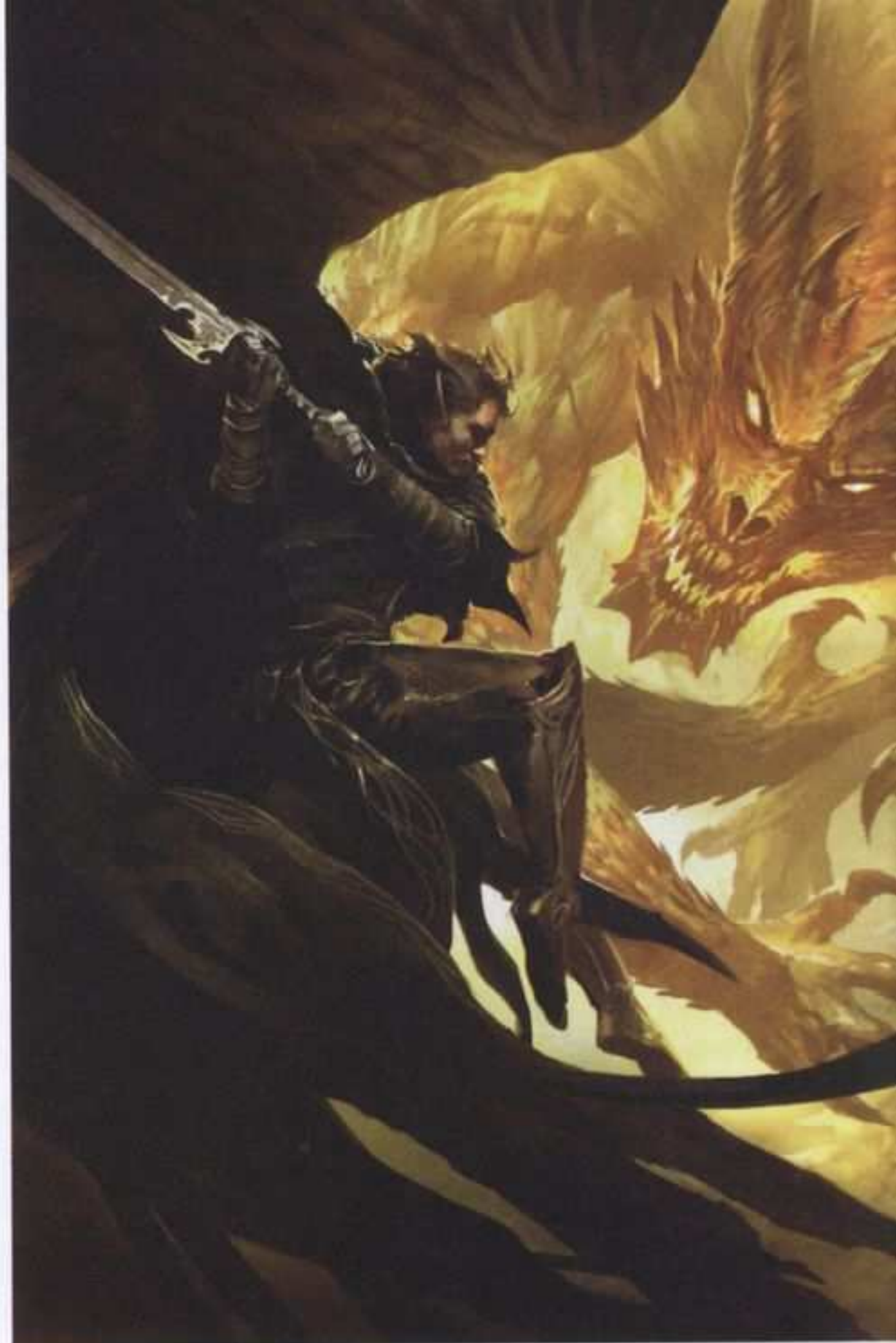
A slayer shrinks from no challenge, not even that of a great dragon

You gain 6 hit points each time you gain a level. You have a number of healing surges per day equal to 9 + your Constitution modifier.