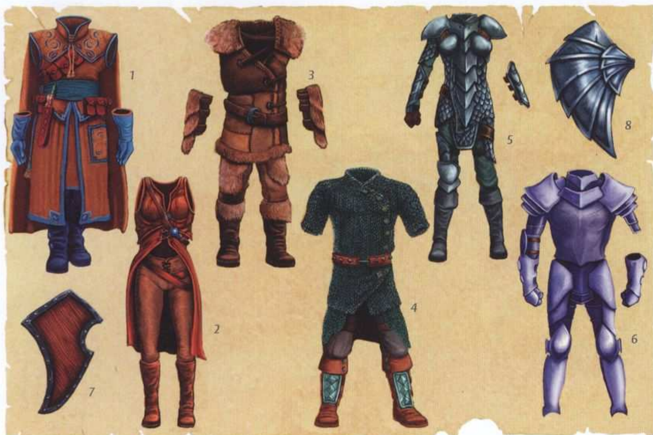
1. Cloth armor; 2. Leather armor; 3. Hide armor; 4. Chainmail; 5. Scale armor; 6. Plate armor; 7. Light shield; 8. Heavy shield

Hide Armor Thicker and heavier than leather, hide armor is composed of skin from any creature that has a tough hide, such as a bear, a griffon, or a dragon. Hide armor can bind and slightly hinder your precision, but it's light enough that it doesn't affect your speed.