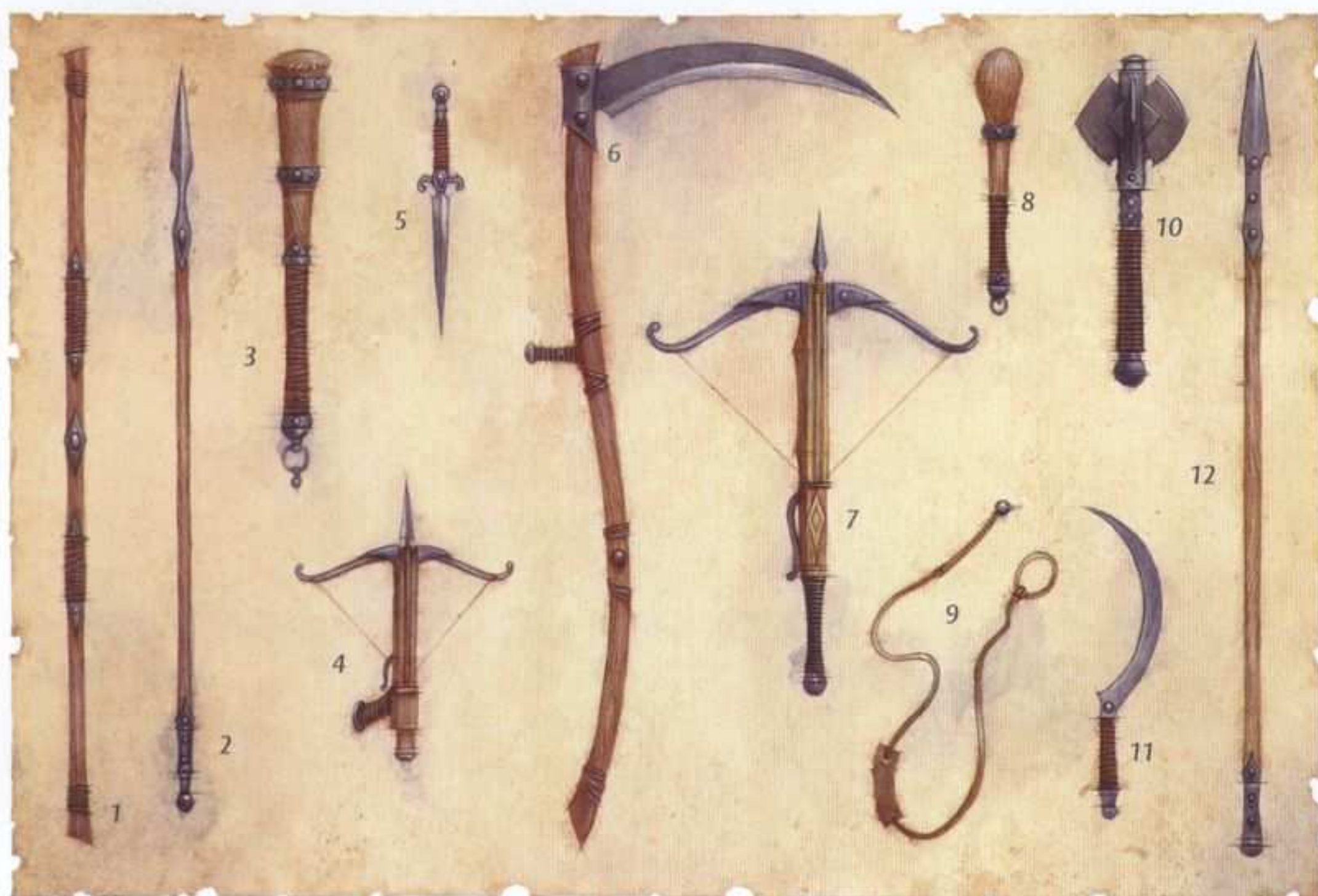
1. Quarterstaff; 2. Javelin; 3. Greatclub; 4. Hand crossbow; 5. Dagger; 6. Scythe; 7. Crossbow; 8. Club; 9. Sling; 10. Mace; 11. Sickle; 12. Spear

Off-Hand (O): An off-hand weapon is light enough that you can hold it and attack effectively with it while holding a weapon in your main hand. You can’t attack with both weapons in the same turn, unless you have a power that lets you do so, but you can attack with either weapon.