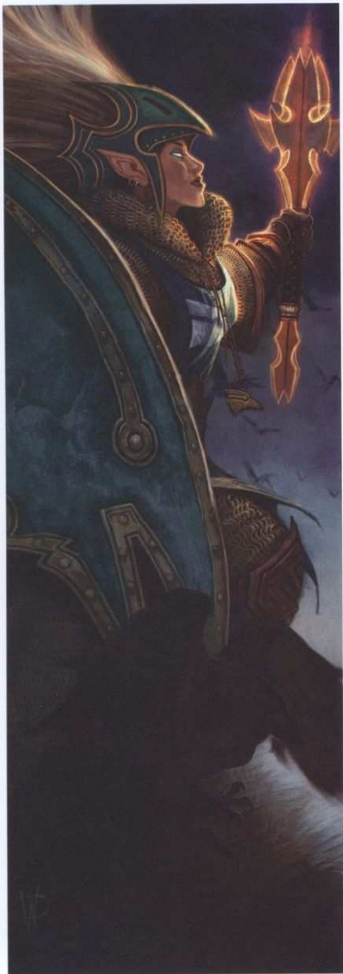
Valenae, eladrin warpriest

Storm Domain A storm might pass quickly, but the damage it unleashes lasts far longer. The wrath and power of the storm god creates moments of fury that can echo through history. The storm is implacable until it has spent its energy—but by then, those who oppose it have been destroyed.