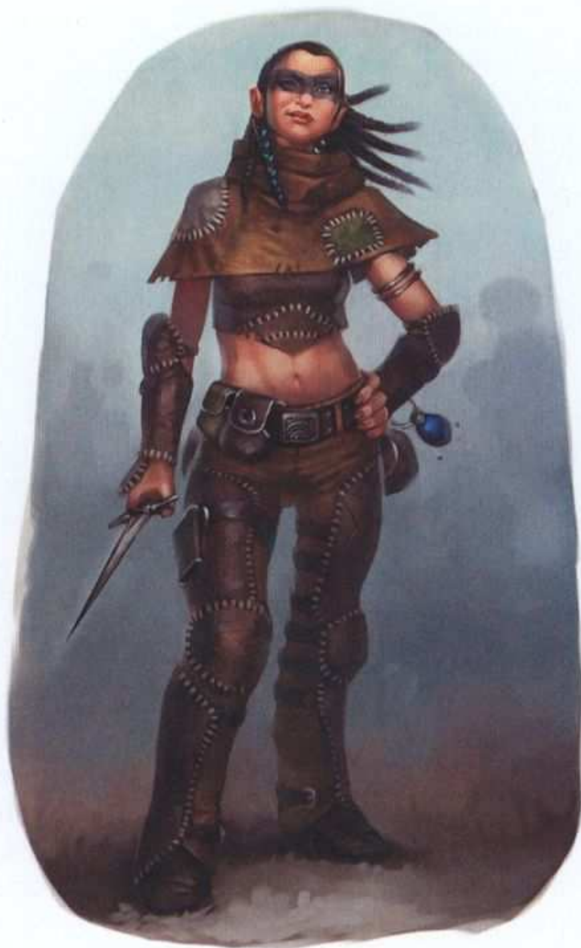
The life of a rogue suits this halfling just fine

Wizard The nomadic existence of many halfling communities makes established academies of knowledge and study rare. However, the halfling love of fables and forgotten lore has created a robust oral tradition of arcane knowledge. Nearly every halfling clan includes a wise elder who can cast a few spells, brew potions, and use rituals to divine the weather. Young halflings who are blessed with quick wits and an inquisitive nature can study under such a master, replacing formal theory and book learning with stories and hands-on arcane experimentation. Such halflings sometimes seek a place in the arcane academies of other races for more formalized training.