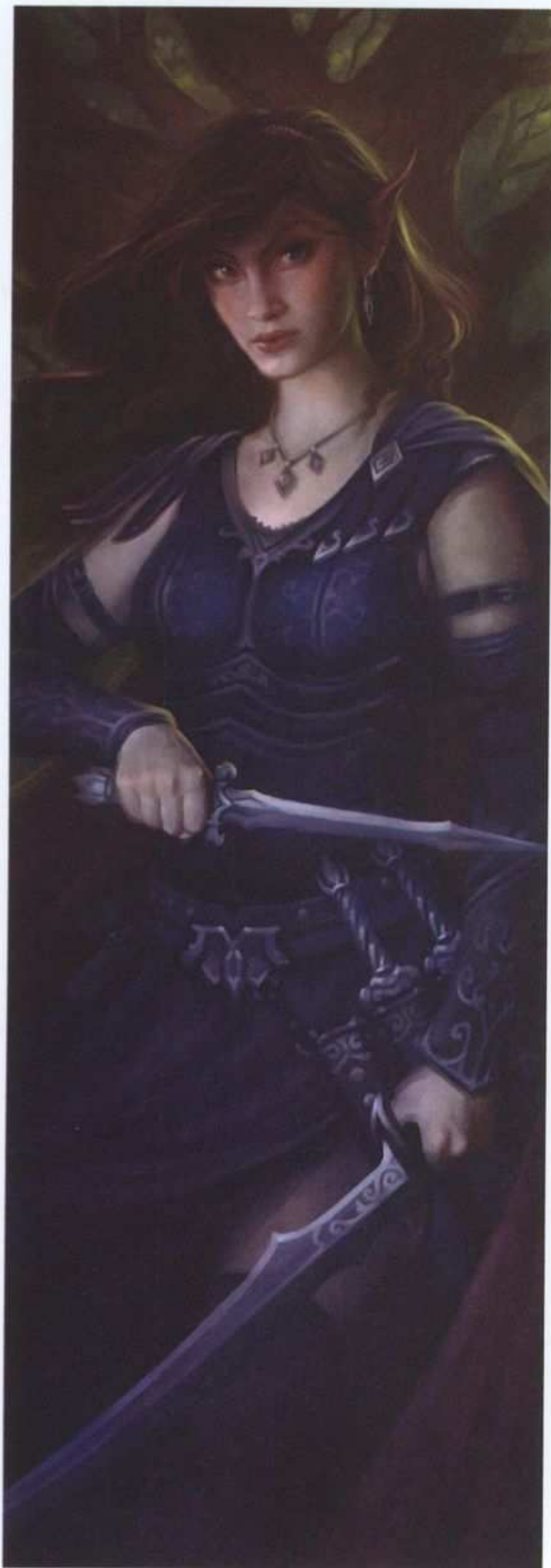
Kelra, elf thief

As an elf thief, you might be an outcast from your people, forced to live in the cities and towns of other races rather than in the forests that were once your home. Having turned to a life of deceit, trickery, and skillful thievery, your reactions and your nimble fingers have allowed you to thrive. Alternatively, you might be a mercenary thief, hiring yourself out to the highest bidder as a clandestine combatant, an explorer, or a spy. You might even take on a similar role among your own people, recovering lost elven relics that have fallen into the wrong hands.